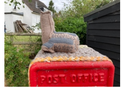
Someone knitted Holy Trinity for us!

It's time to write to you all, reporting on our year so far and looking ahead to our plans for Christmas – yes, it's that time of year!